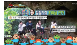
Photo Frame Effects - Compact performance When you can use this type of subtitle design effect, embedding an appropriate topic name is also critical.

Screen contras section - You can use this kind of subtitle when comparing two or more different personalities or performances. Similar or opposite combinations can also use this effect.